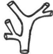
Supplementary Figure 1 Illustration of intra-hepatic bile duct variants according to Huang classification. A: Type A1; B: Type A2; C: Type A3; D: Type A4; E: Type A5.