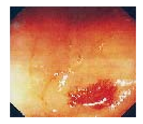
Figure 3 Typical angiodysplasia in the ileum diagnosed during IOE.

For many years, IOE has been the only method for evaluating the mucosal surface of the complete small intestine. This procedure is limited to patients who are operative candidates and have recurrent or severe bleeding episodes<sup>[16]</sup>, since IOE is an invasive procedure requiring general anesthesia. Several methods for IOE such as peroral approach, transanal and direct intubation through a surgical incision of the small intestine are now available. The latter is method used in our series and allowed for the examination of the entire small intestine in all the patients. In general, the diagnostic yield of IOE is high when patients are highly selected for such procedures. It was reported that IOE can detect 70-80% sources of bleeding<sup>[17]</sup>. In our series, a probable or definite bleeding source was found in 68 (84%) of the 81 patients. The IOE procedure allowed for the endoscopic or surgical treatment of the lesions during the same session in all our patients.