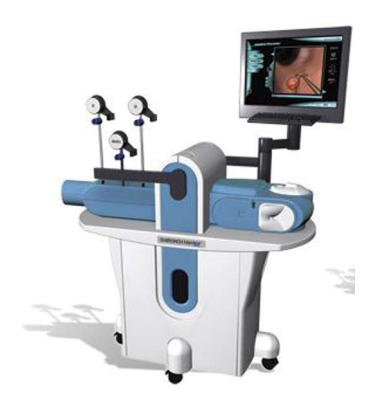
Figure 1 The GI Mentor II simulator (Simbionix, Cleveland, United States), photo provided courtesy of Simbionix.

Virtual endoscopy simulators are integrated systems that consist of mechanical parts and software. They run a computer program that simulates the procedure of endoscopy using endoscopic images of the gastrointestinal tract while the trainee handles an endoscope attached to a processor that gives a signal to a monitor. The moves of the endoscope interact with the monitor image, offering the user a virtual environment for practicing theoretical and practical knowledge under various conditions<sup>[12]</sup>. There are currently two virtual simulators in the market: GI Mentor (Simbionix, Cleveland, United States) and Accutouch Simulator, recently renamed as CAE EndoVR Simulator (CAE Healthcare, Montreal, Quebec, Canada)<sup>[13-15]</sup>. There are also simulators available for non-com-