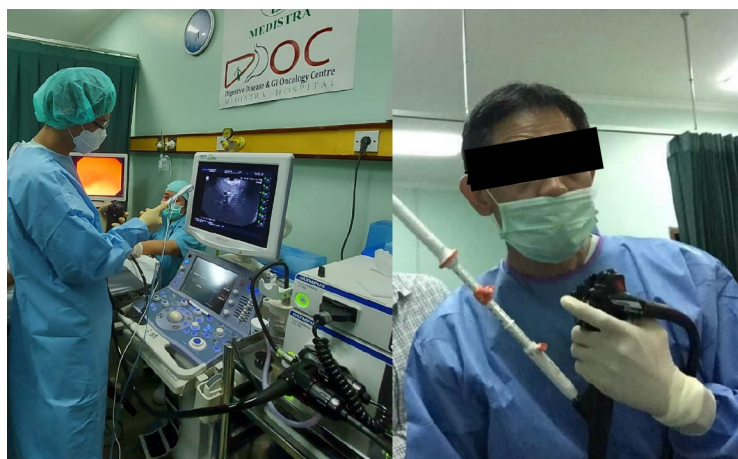
DOI: 10.4240/wjgs.v15.i2.163 Copyright ©The Author(s) 2023.