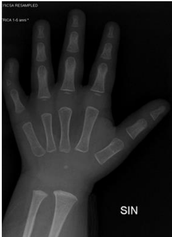
Supplementary Figure 2 Bone x ray performed at 3 years of age, was correspondent to 3 mo of age for the carpus and 12-16 mo for the phalanges in the presence of suspected malformation of the intermediate phalanx of the fifth finger.