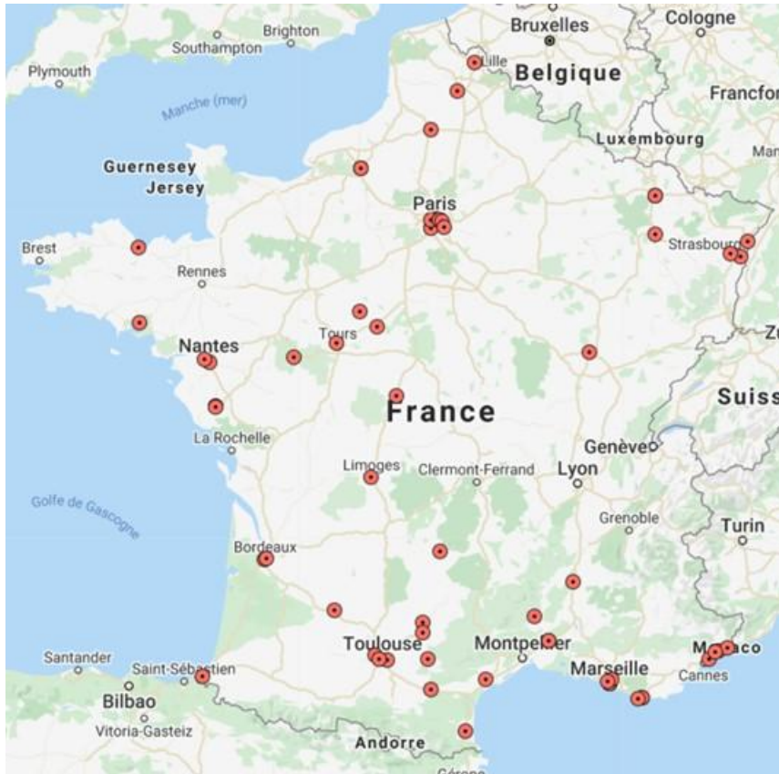
Supplementary Figure 1 Distribution of investigator centers throughout France.