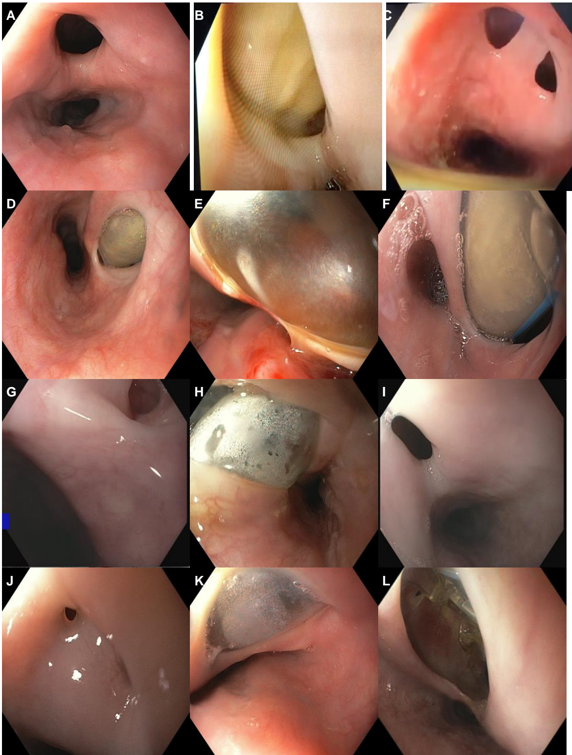
Supplementary Figure 1. Tracheoesophageal fistulas