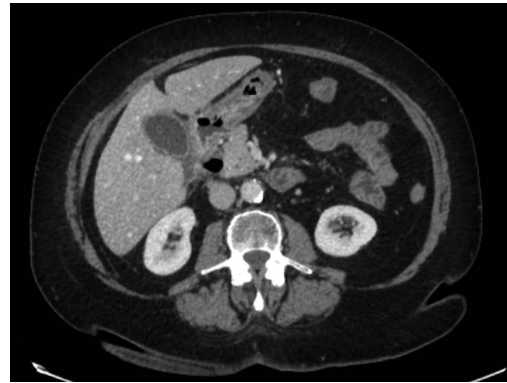
Figure 1 Computed tomography scan of case 5 showing a perforated duodenal diverticula.

The non-surgically treated case was treated with antibiotics and a nasogastric tube because presented with