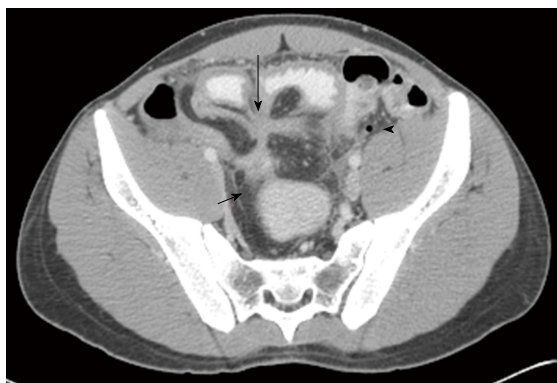
Figure 1 Axial, post contrast computed tomography (image of a 21 yr male with first time presentation of Crohn's disease). There is approximately 20 cm distal ileal bowel segment involved in the disease with wall thickening and increased enhancement (level 2). There are 2 fistula formation; one entero-enteric between the distal small bowel and terminal ileum (long arrow) and second, entero-colonic fistula involving the sigmoid bowel (short arrow). The oral contrast material has not reached the colon at the time of the scan, however it is seen in the sigmoid due to passage through the entero-colonic fistula. A small amount of free fluid is seen on the left with a free air bubble from suspected perforation (arrowhead). There is also pre stenotic dilatation proximal to the fistulas, not seen in the image.

the medical records of all patients with an established diagnosis of CD who were seen between February 2006 and August 2014 at the Hadassah-Hebrew University Medical Center. Patients were included in the study if they were hospitalized or seen as an outpatient at the inflammatory bowel diseases (IBD) clinic, had intra-abdominal fistulizing CD according to cross-sectional imaging (CT or MRI) available for analysis, and had a minimum of 1 year follow-up after the imaging study. We excluded all patients who underwent surgery within 6 mo prior to imaging. Penetrating disease at presentation was defined when observed on an imaging study within 12 mo of diagnosis of CD. This time-frame was chosen since there is often a delay in pursuing cross-sectional imaging with new onset CD. This study was reviewed and approved by the Hadassah- Hebrew University Helsinki committee.