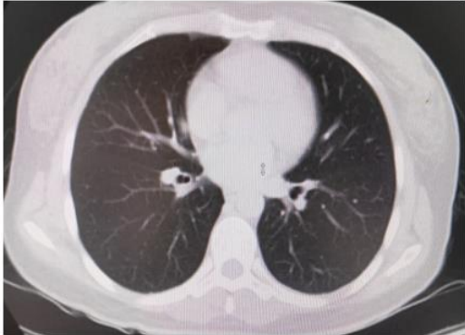
February 5th 2021