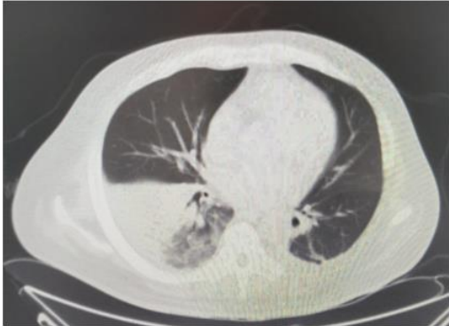
January 26th 2021