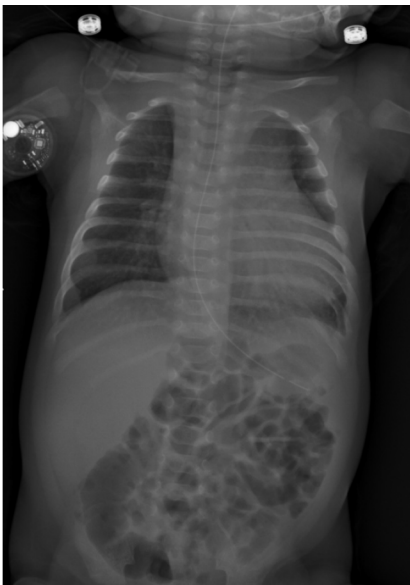
Figure 1 Chest and abdomen X-ray, showing a cardiomeastinal image slightly above normal limits.